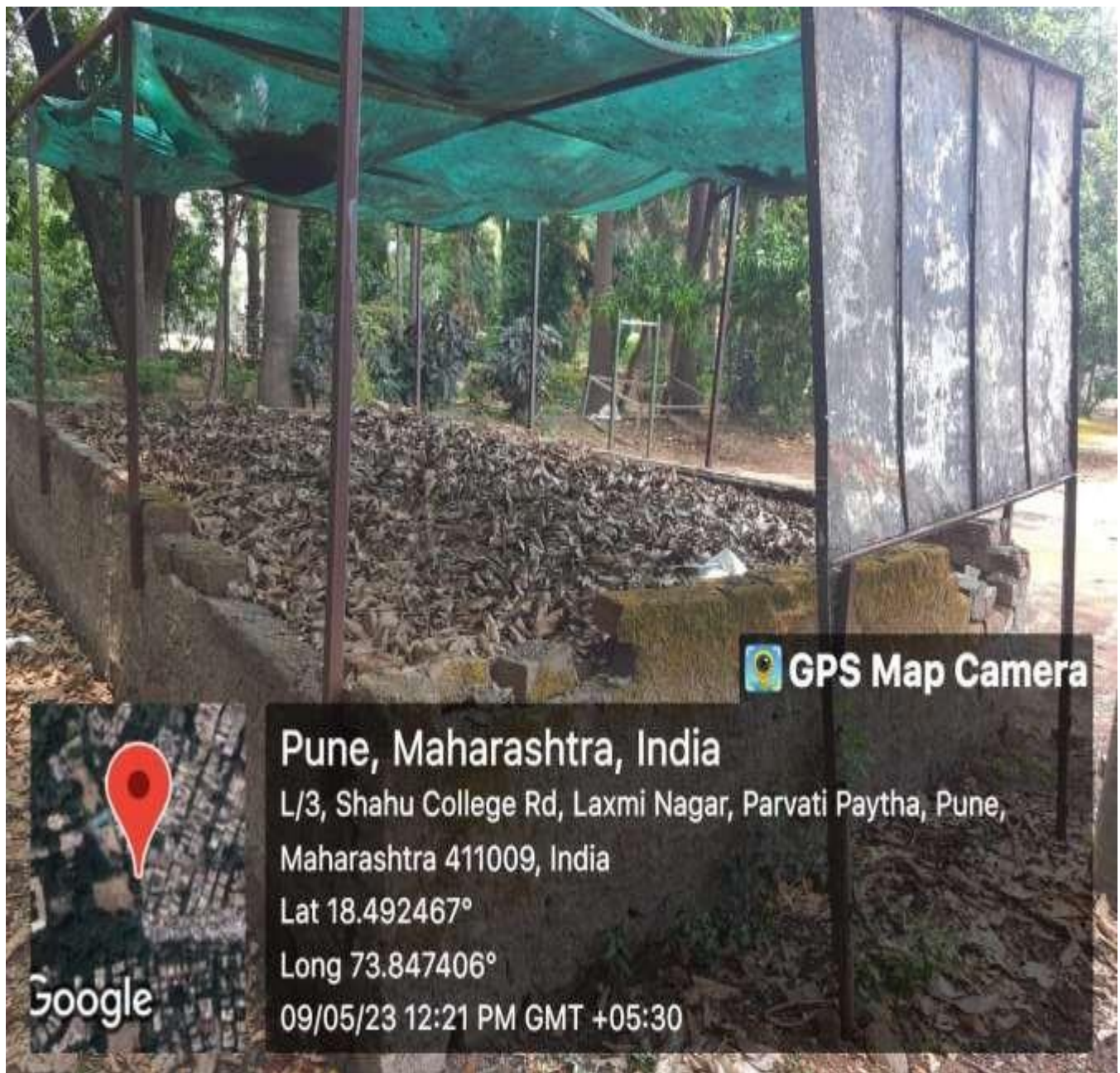
Bio-degradable solid waste management in the institute campus