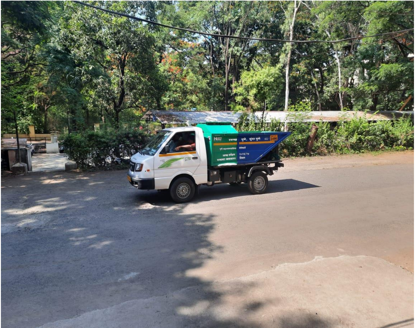
PMC Waste Collection Vehicle