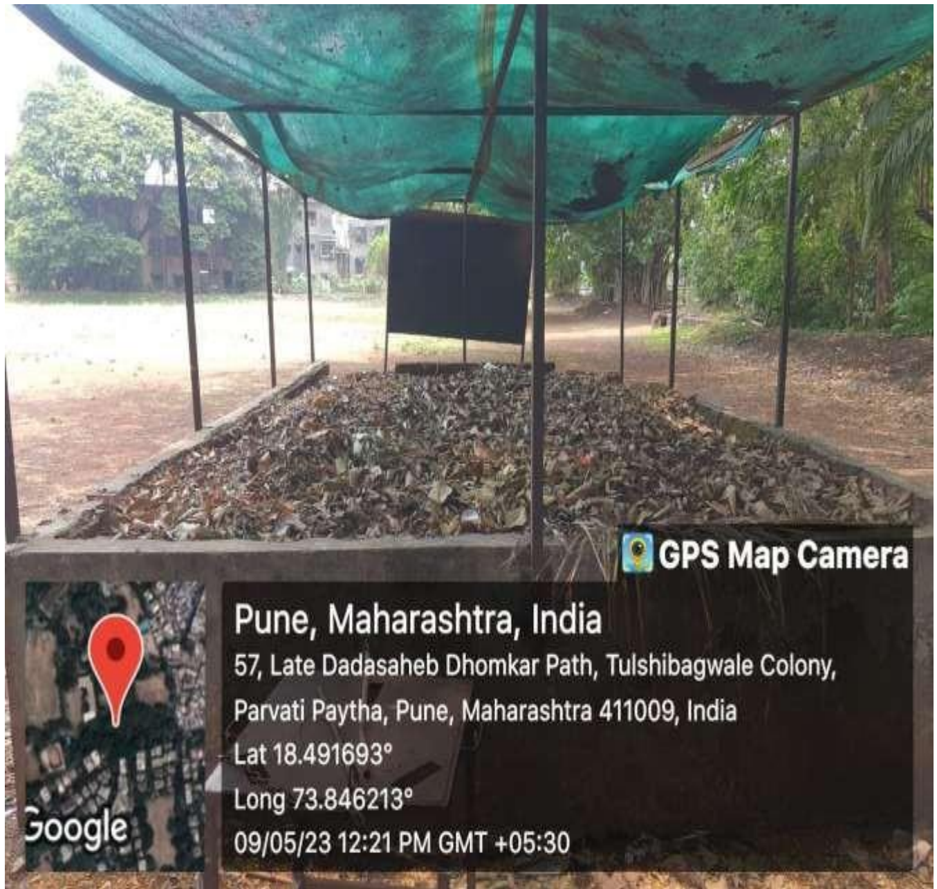
Bio-degradable solid waste management in the institute campus